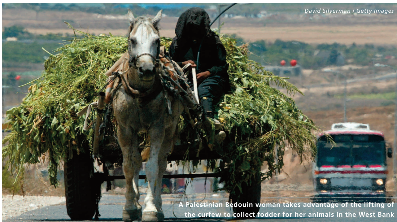
A Palestinian Bedouin woman takes advantage of the lifting of the curfew to collect fodder for her animals in the West Bank

Individual projects cannot adequately address the deteriorating economic situation of Palestinians, nor create the conditions needed to build confidence in a political solution. Given the existence of technical frameworks to monitor progress on commitments already made, such as the roadmap and the Agreement on Movement and Access, the Quartet could use more of its resources to ensure that the political will to change things on the ground is created and concrete follow-up is undertaken. The Quartet should provide regular, public information on progress it has made to date on projects to help build confidence in private sector initiatives. The Quartet Representative should commission and publicise legal analysis of any proposed project to ensure that such interventions do not violate international law.